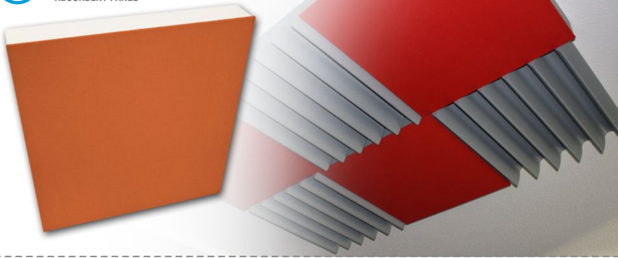
Image of 60x60cm model Ref.:CAM060 (on the left) and Ref.:CAM060 applied (ambient image).