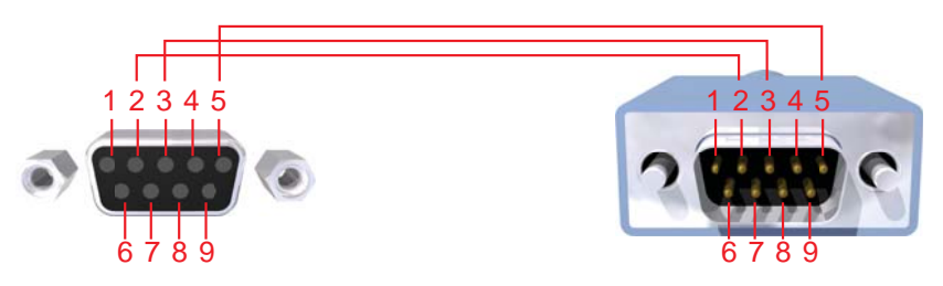
Only Pins 2 (RX), 3 (TX), and 5 (Ground) are used on the RS-232 serial interface