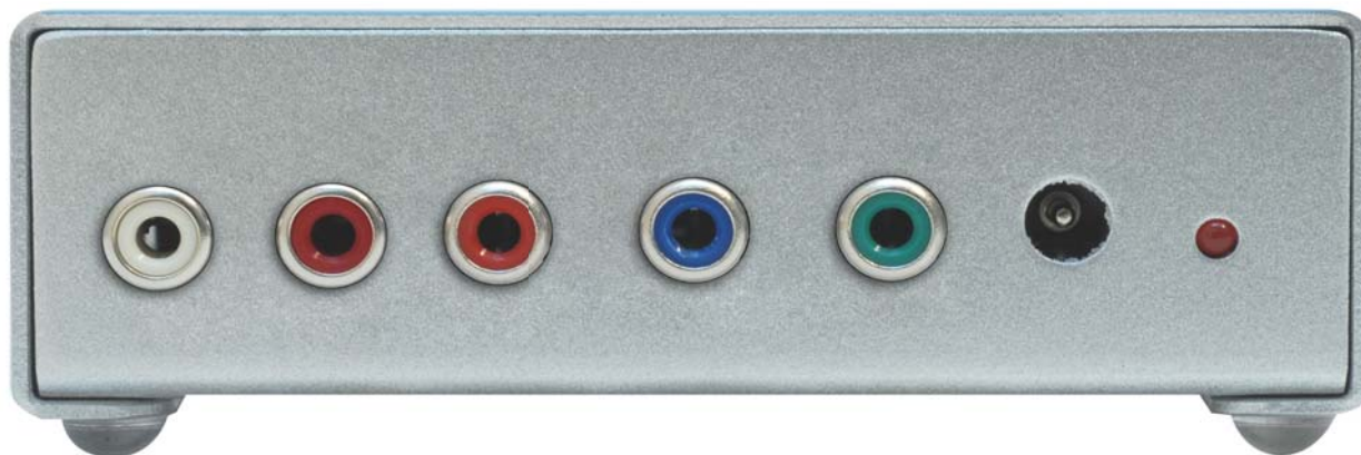
L+R Audio Inputs